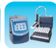
Total Organic Carbon 3800