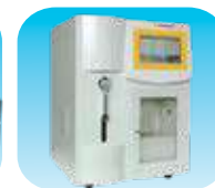
Liquid Partical Counter