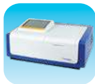
UV/VIS Spectro 2080+ Double Beam